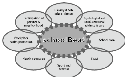
Figure 2. The Dutch Healthy School Model, based on the American 'Healthy School Model' (Leurs & de Vries, 2005)

11 focus group discussions with 37 students (14 years), 8 parents and 20 school staff members, from 3 schools. Quotations were coded to categories suggested in the EnRG-framework (fig. 1). Analysis with the Atlas.ti program.